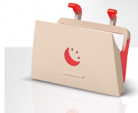
Backlit buttons with day & night design marking