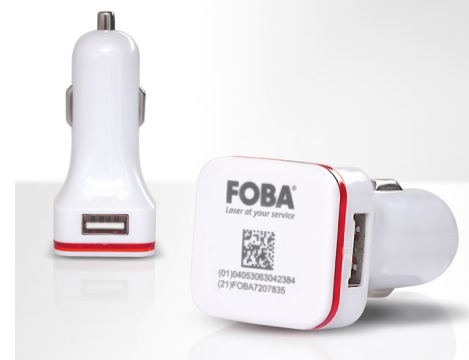
Cable with color change Tube for invasive use with laser mark that can be sterilized Charger with color change and UDI code