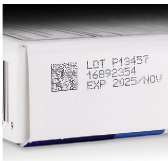
Pharma – paperboard

* Subject to availability in your country