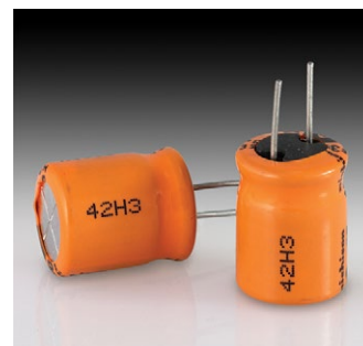
Electronic components – plastic