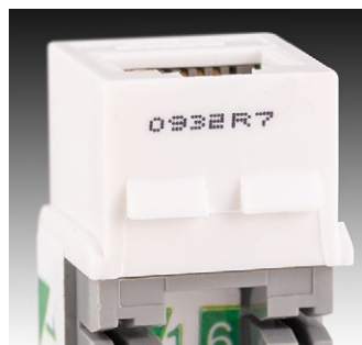
Electronics – plastic