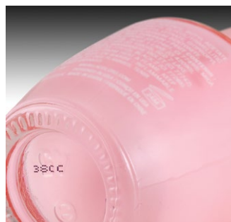
Cosmetics – glass